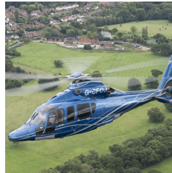
EC155 (Max: 6 passengers) Segregated Passenger Cabin