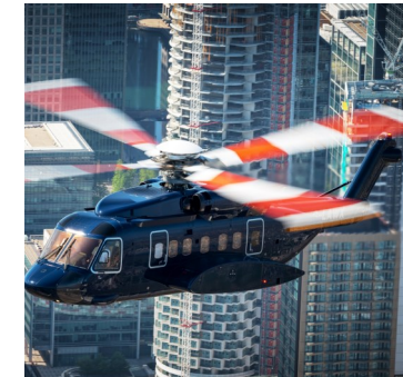
S92 (Max: 16 Passengers) Segregated Passenger Cabin