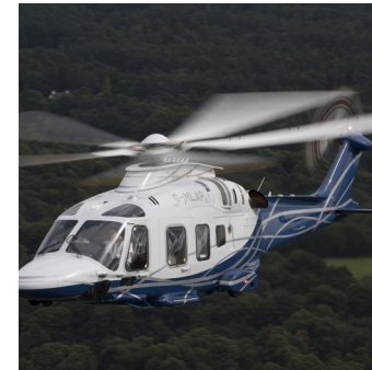
AW169 (Max: 7 Passengers) Segregated Passenger Cabin